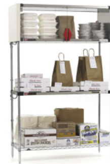
Shown with heated shelf, enclosure kit and standard Super Erecta shelving.