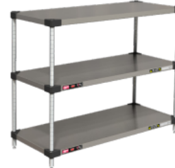
Shown as a tiered shelving unit.