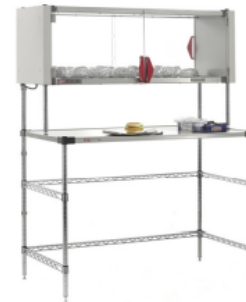
Heated shelf enclosure kit shown with a Super Erecta workstation.