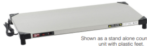
Shown as a stand alone counter-top unit with plastic feet.