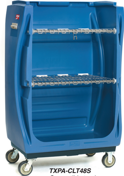
TXPA-CLT48S Convertible truck