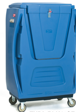
TXPA-BLK48SEC Bulk truck, with enclosures

Gate and Lid: (option for bulk truck) Molded polymer construction with Microban® antimicrobial product protection, with stainless steel hinges, latch and hardware. Color: Medium Blue