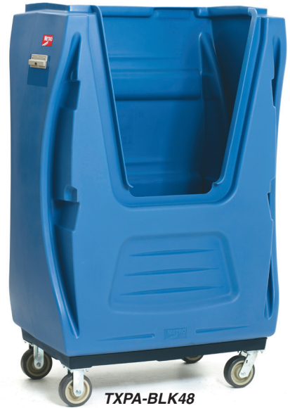
TXPA-BLK48 Bulk truck, with no enclosures

*Microban® antimicrobial protection inhibits the growth of stain and odor-causing bacteria, keeping the surface areas “cleaner between cleanings.”