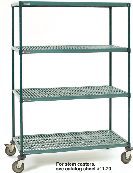
For stem casters, see catalog sheet #11.20